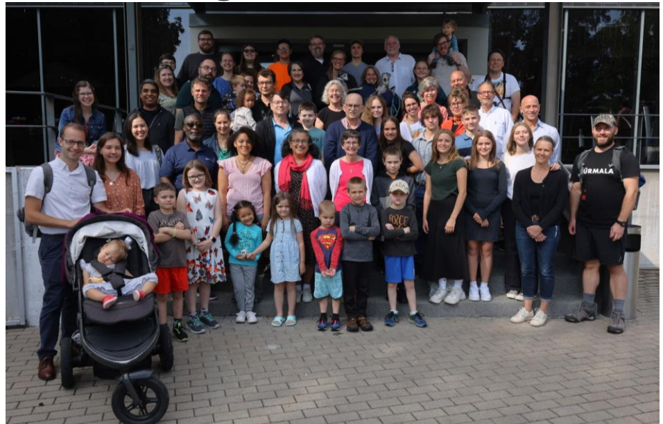
Eurasia missionaries and their families at the regional retreat in Jūrmala, Latvia.

During Aug. 14-18, Eurasia missionaries and their families gathered in Jūrmala, Latvia for our Eurasia Regional Missionary Retreat. This was my fourth and final regional meeting, with previous retreats held in Lithuania (2018), Ukraine (2019), and Greece (2022).